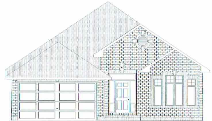
Front Elevation 'B'